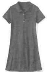
Example of approved polo style dress